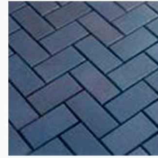
Blue brick edgings