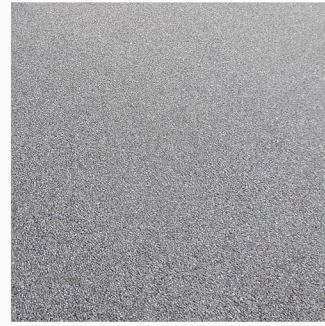
SureSet permeable paving